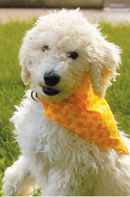
Leslie Klipsch Daffodil sports a yellow bandanna from Four Feet Treats.